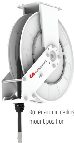
Roller arm in ceiling mount position

Full metal, heavy-duty, double pedestal arm hose reels, with hose capacity up to 50' x 1/2" hose