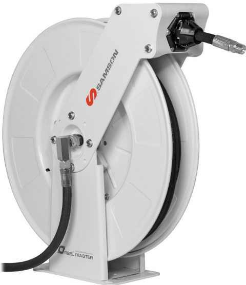
Roller arm in tank/wall mount position